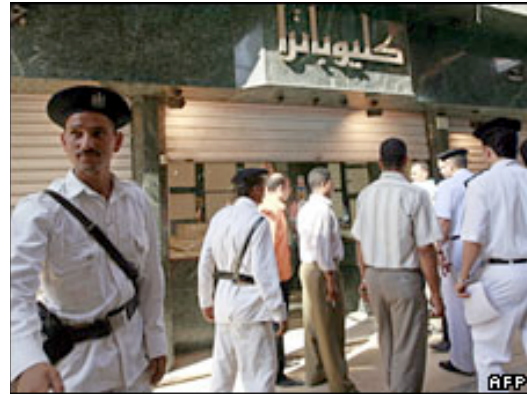
The motive for the daylight killings remains unclear