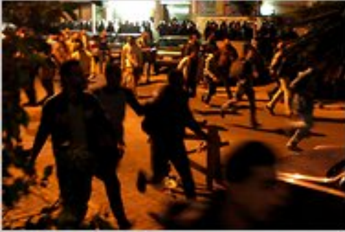
Demonstrators ran past a line of riot police officers, background, on Sunday near the Coptic church in Alexandria that was attacked early Saturday.

The official MENA news agency reported that the authorities were examining the remains of two heads found after the blast in the belief that one might have belonged to the bomber.