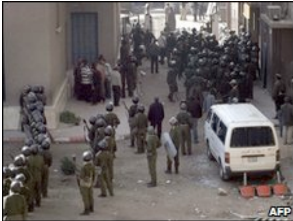
Security is tight outside the hospital in Naga Hamady

Clashes have broken out in the southern Egyptian town where seven people died in a drive-by shooting outside a church after a Coptic Christmas Eve Mass.