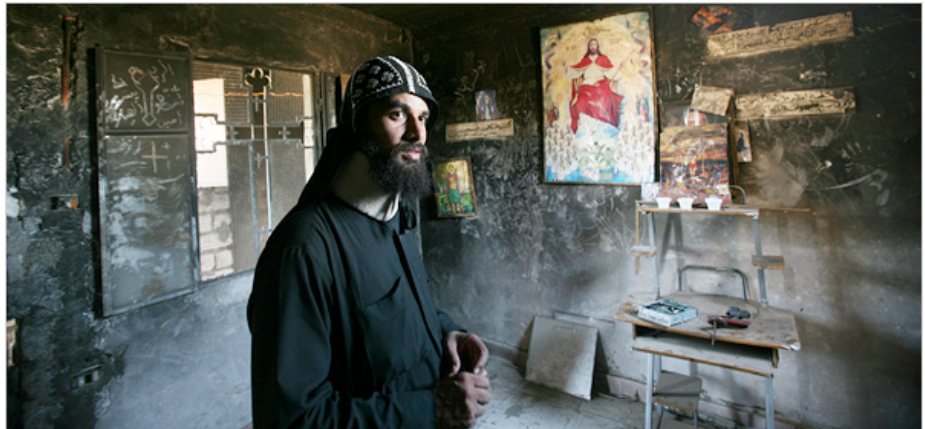
A monk at the Abu Fana Monastery wore a neck brace this week after a violent clash at the monastery in May.

CAIRO — A monastery was ransacked in January. In May, monks there were kidnapped, whipped and beaten and ordered to spit on the cross. Christian-owned jewelry stores were robbed over the summer. The rash of violence was so bad that one prominent Egyptian writer worried it had become “open season” on the nation’s Christians.